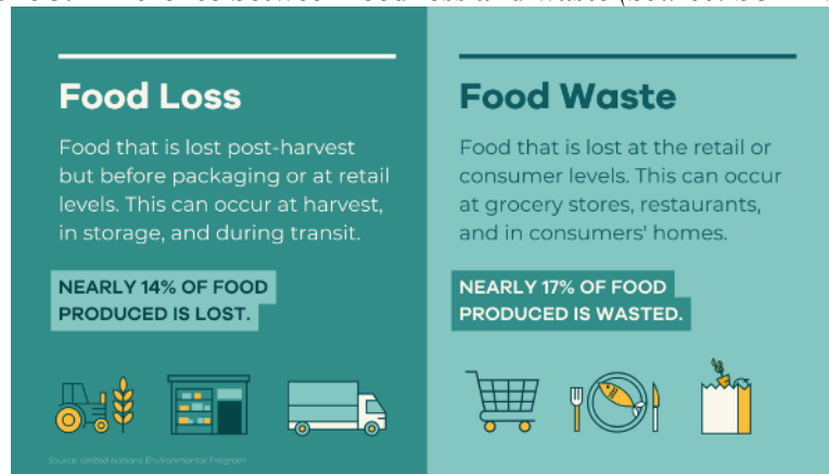
Figure 3. Difference between food loss and waste

Food loss represents the loss right before consumption (Figure 3) and waste occurs in consumer level.